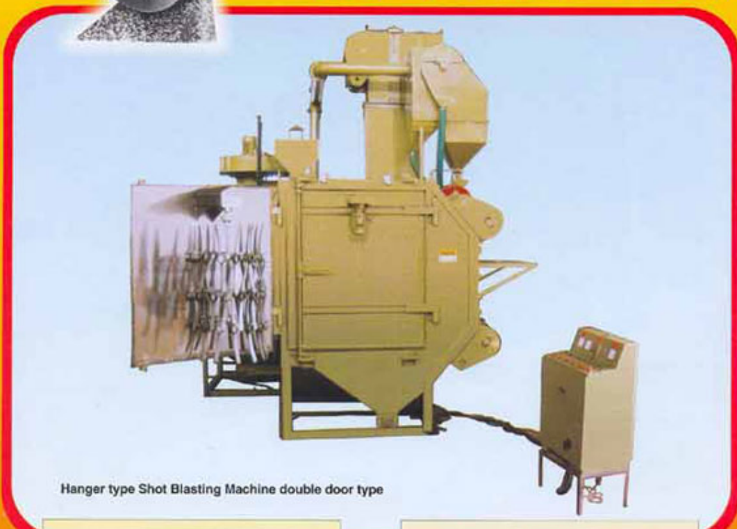
Hanger type Shot Blasting Machine double door type