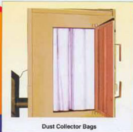
Dust Collector Bags