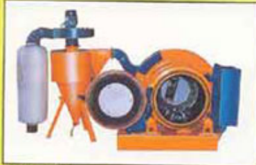
Model - R B C