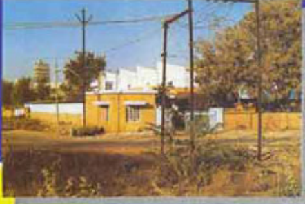
The full fledged production unit at Jodhpur.