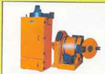
Model - R B F