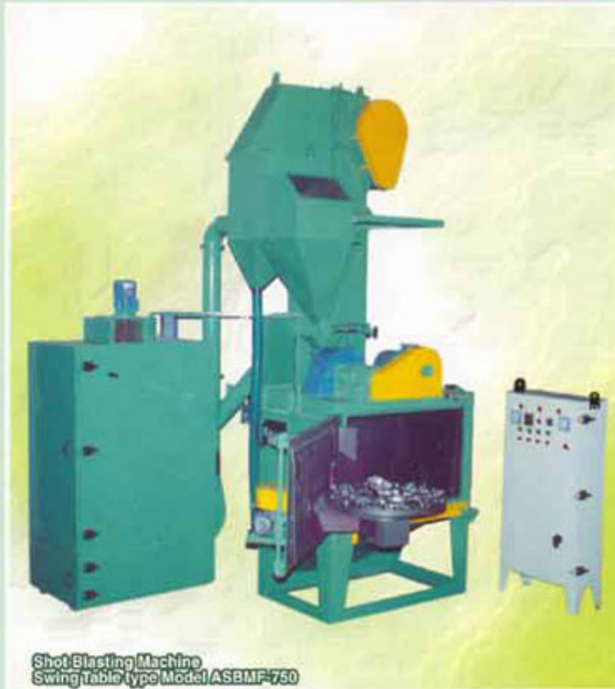
Shot Blasting Machine Swing Table type Model ASBMF-750