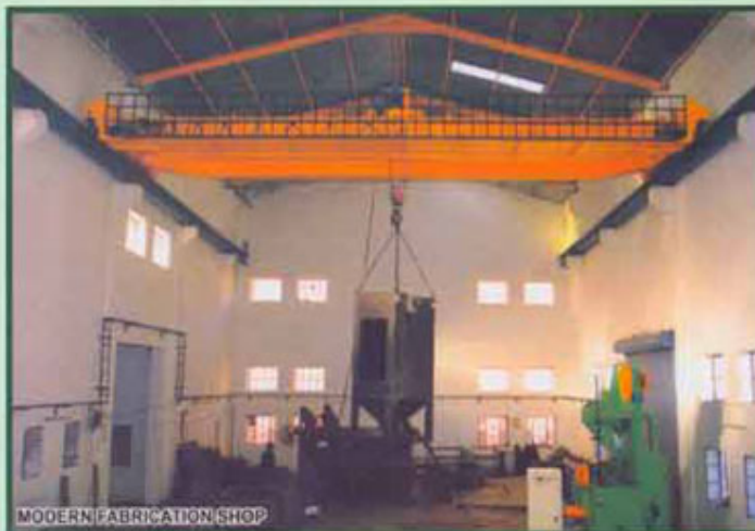
MODERN FABRICATION SHOP

These machines are sturdy, rugged and proven design to carry out multifarious jobs of cleaning and peening in faster and better than any other makes of the machine. The latest design and the most powerful low maintenance blast wheel is fitted. Dust Collector option is available i.e. Fabric Bag type, Reverse Pulsejet type, Cartridge type as per your choice. Machine is available with various optional features like Second Door with Table, Programme Logic Control system, Time Control, Electronic Brake system for blast wheel, sound reducer etc. Please select optional features as per your choice (For detail please refer Technical specification sheet)